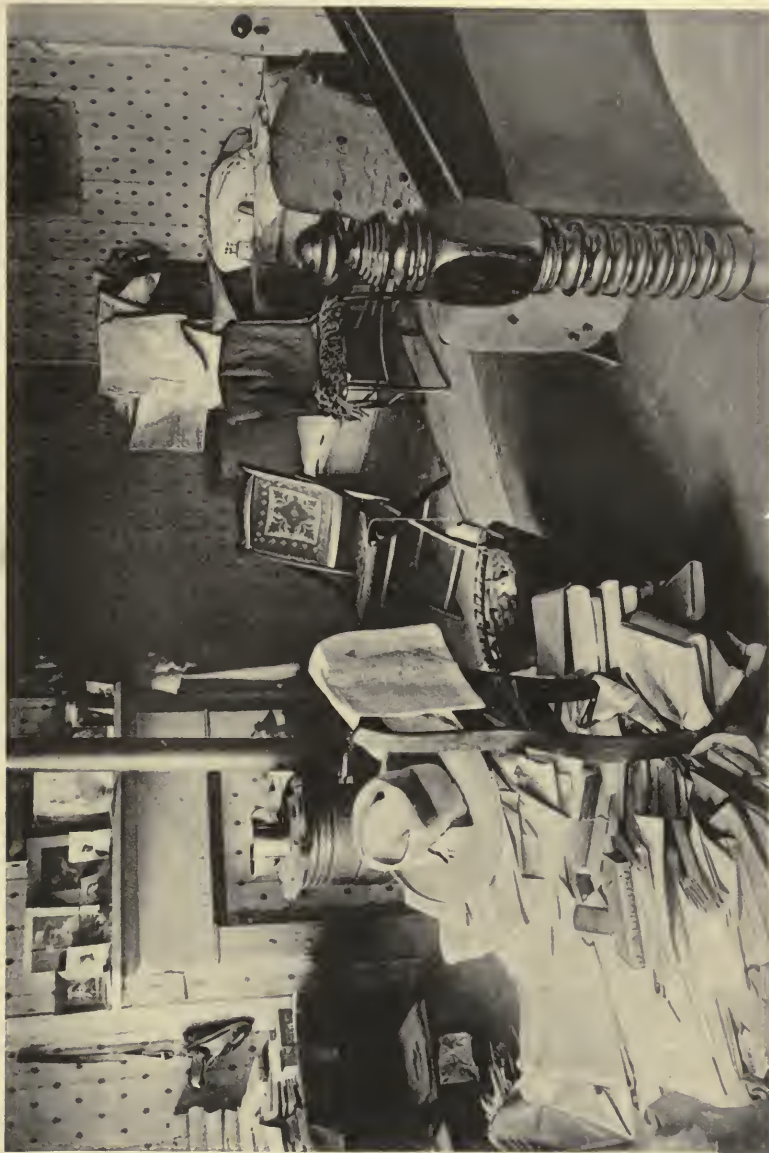
WALT WHITMAN'S ROOM CAMDEN, NEW JERSEY.